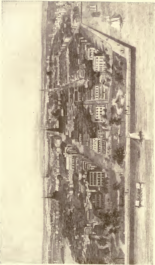
VIEW OF CHARLESTON DURING THE WAR.